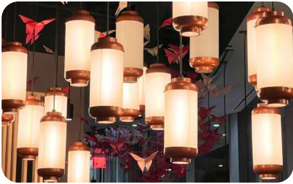
Origami Installations for Clean Water

C C C C C C C C C C C C C C C C C C C C C C C C C C C C C C C C C C C CC C C C C