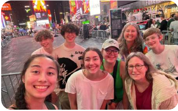
Change Makers Shine at Origami USA

DC C C b C C C C DOb C C b C C C C C C C C C C C C C C C C C C C C C C C C C DC C C C C C b C C C C C C