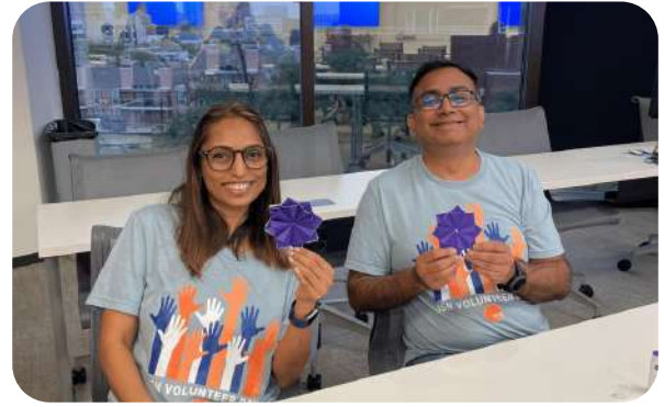
Teambuilding with a Cause

DC C C b C C C C DOb C C b C C C C C C C C C C C C C C C C C C C C C C C C C DC C C C C C b C C C C C C