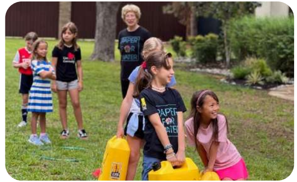
A Special Day of Giving

C C C C C C C C C C C C h C C C C C C C C C C C C C C C C C C C C C C CC C C C C C C C C C C C C C CC C C C C C C C C C C C C C C C DC C C C C